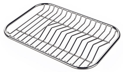
Stainless steel plate rack 8100 154