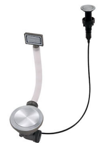
Space Push automatic waste fitting 8407 116