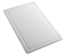
HPDE Chopping board 8657 001