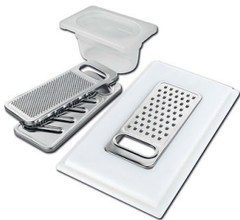
Graters kit with ring-holder and food collection tray