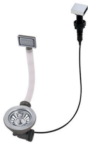
Automatic waste fitting 8407 113