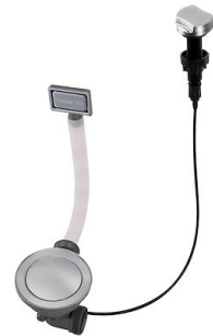
Space automatic waste fitting 8407 109