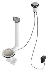
Space Light automatic waste fitting 8407 117